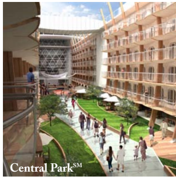
Central Park SM

Spend your afternoons strolling through Central Park SM or riding the carousel on the Boardwalk SM . Then, at night, visit the AquaTheater to watch a mesmerizing water show or enjoy dinner with friends at a café on the Royal Promenade. And that's just the beginning!