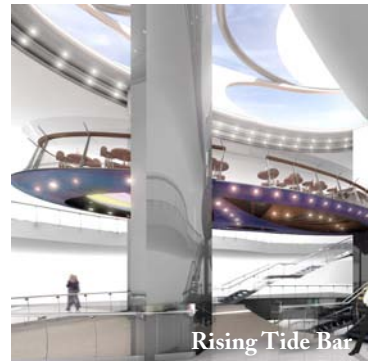
Rising Tide Bar