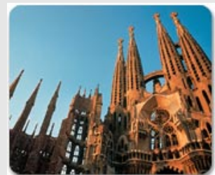
Barcelona, Spain 21 April