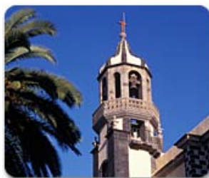
Tenerife, Canary Islands 19 April