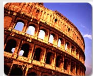
Civitavecchia (Rome), Italy 24 April