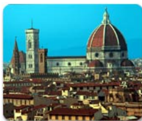
Livorno (Florence / Pisa), Italy 23 April