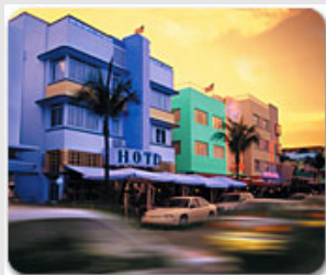
Miami, FL 10 April